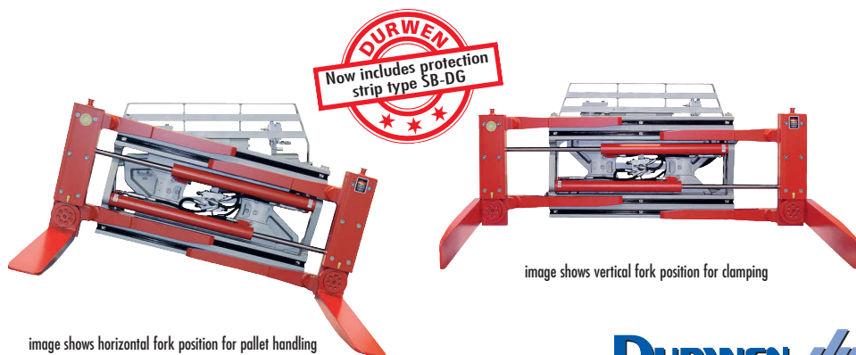
image shows horizontal fork position for pallet handling