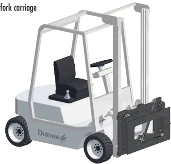
quick change unit, hook-on base frame